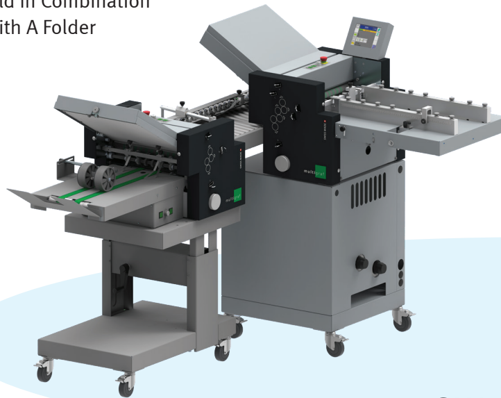
Cross Fold In Combination With A Folder