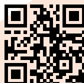
Info on Website