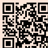
iECHO Cutting System