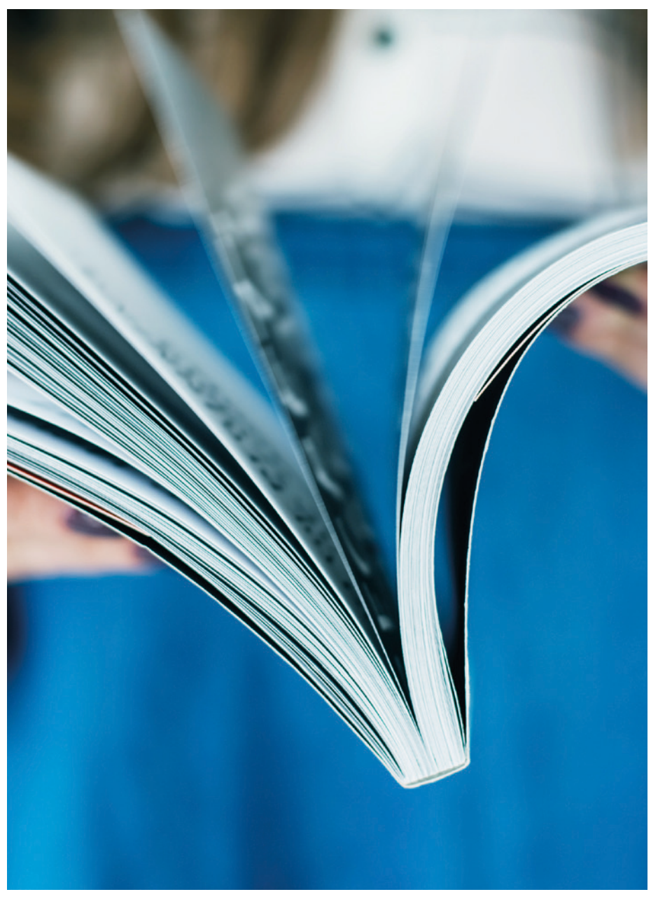
Durable and high-quality adhesive bonds – even for the most challenging of surfaces